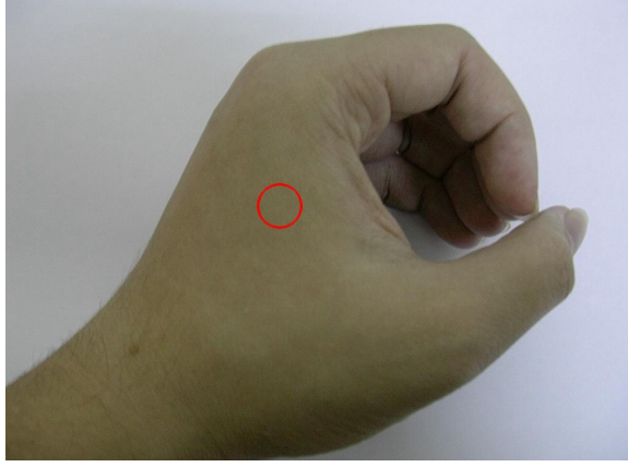
Figure 2: Illustration of measurement site.